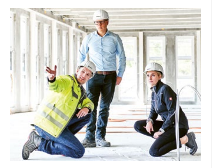
Realize projects together as a team and develop new innovative solutions for the buildings of tomorrow.